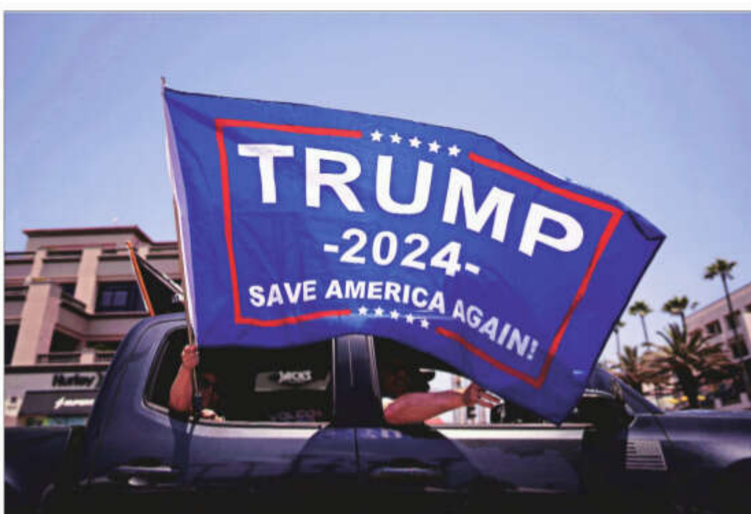
People rally in support of Republican presidential candidate former President Donald Trump in Huntington Beach, California on Sunday

Trump said that following the judge's decision on Monday dismissing the documents case, his other outstanding prosecutions should also be thrown out. He is still awaiting trial on two