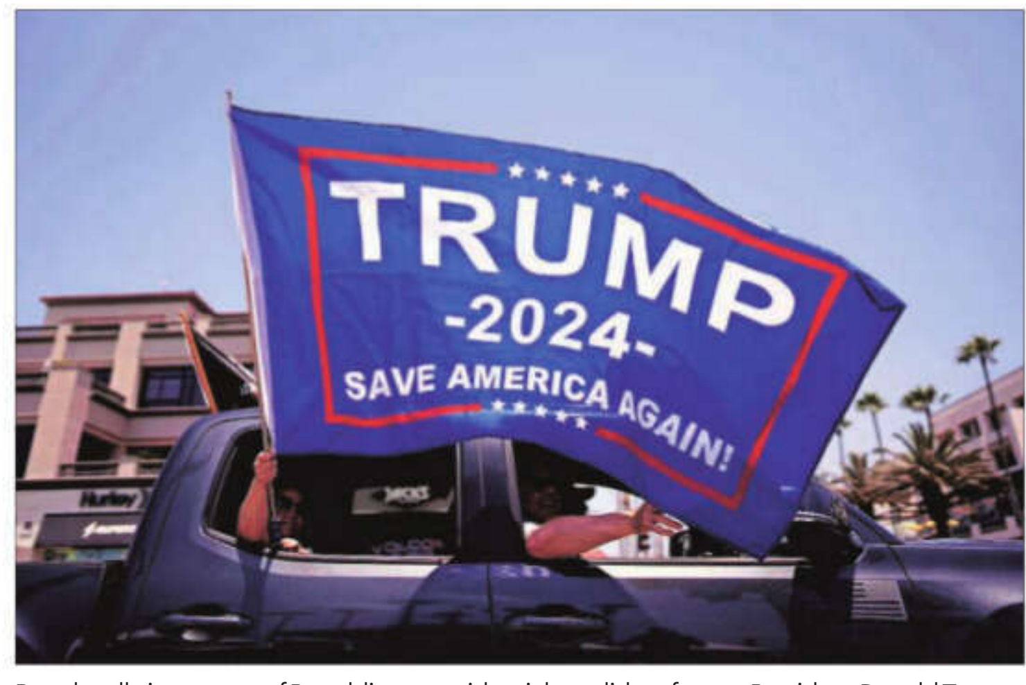
People rally in support of Republican presidential candidate former President Donald Trump in Huntington Beach, California on Sunday

DONALD TRUMP WON a major legal victory on Monday when a federal judge dismissed one of the criminal prosecutions against him, as he prepared to accept the Republican Party's presidential nomination just days after surviving an assassination attempt.